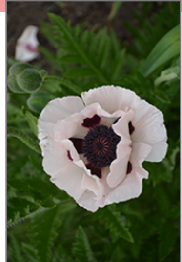
Royal Wedding Poppy flowers