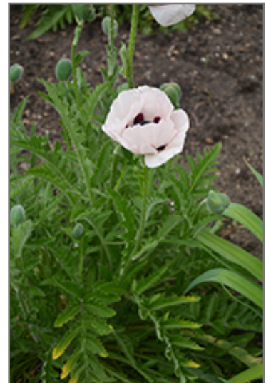
Royal Wedding Poppy in bloom