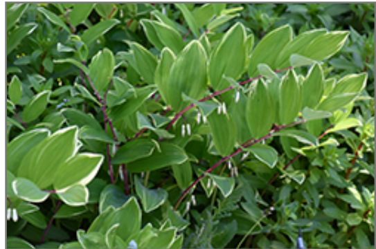
Variegated Solomon's Seal flowers