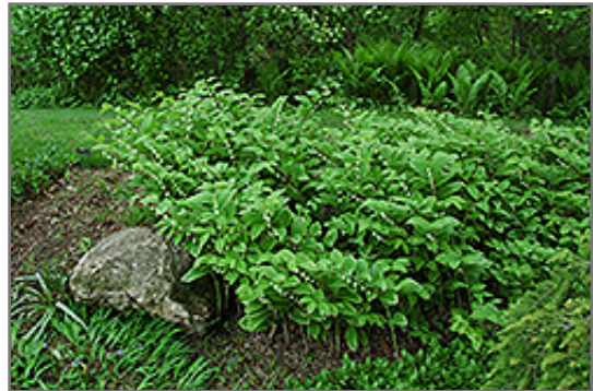
Variegated Solomon's Seal in bloom