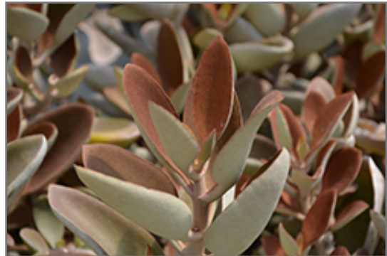
Copper Spoons foliage