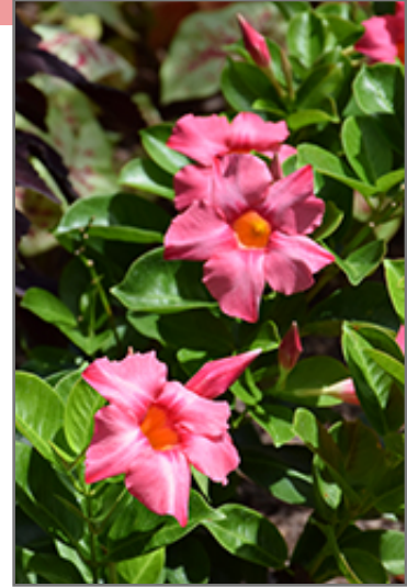
Madinia Coral Pink Mandevilla flowers

This plant does best in full sun to partial shade. It requires an evenly moist well-drained soil for optimal growth. It is not particular as to soil type or pH. It is highly tolerant of urban pollution and will even thrive in inner city environments. This particular variety is an interspecific hybrid, and parts of it are known to be toxic to humans and animals, so care should be exercised in planting it around children and pets. It can be propagated by cuttings; however, as a cultivated variety, be aware that it may be subject to certain restrictions or prohibitions on propagation.