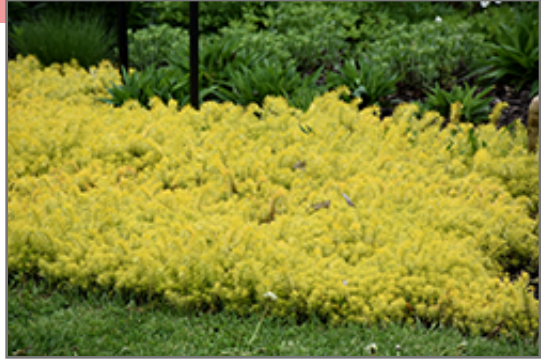
Angelina Stonecrop

This plant does best in full sun to partial shade. It prefers dry to average moisture levels with very well-drained soil, and will often die in standing water. It is considered to be drought-tolerant, and thus makes an ideal choice for a low-water garden or xeriscape application. It is not particular as to soil pH, but grows best in poor soils, and is able to handle environmental salt. It is highly tolerant of urban pollution and will even thrive in inner city environments. This is a selected variety of a species not originally from North America. It can be propagated by division; however, as a cultivated variety, be aware that it may be subject to certain restrictions or prohibitions on propagation.