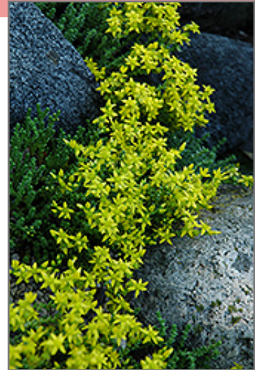
Six Row Stonecrop flowers