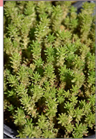
Six Row Stonecrop foliage

Six Row Stonecrop is a fine choice for the garden, but it is also a good selection for planting in outdoor pots and containers. Because of its spreading habit of growth, it is ideally suited for use as a 'spiller' in the 'spiller-thriller-filler' container combination; plant it near the edges where it can spill gracefully over the pot. Note that when growing plants in outdoor containers and baskets, they may require more frequent waterings than they would in the yard or garden.