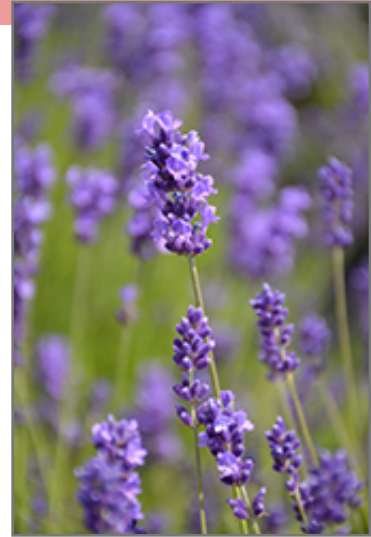
Imperial Gem Lavender flowers

Imperial Gem Lavender is recommended for the following landscape applications;