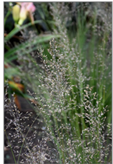
Gone With The Wind Prairie Dropseed flowers