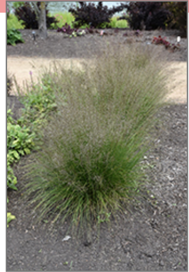
Gone With The Wind Prairie Dropseed

Gone With The Wind Prairie Dropseed is recommended for the following landscape applications;