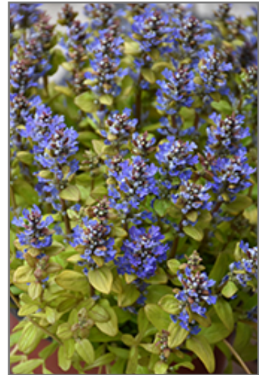
Feathered Friends Fancy Finch Bugleweed flowers

Feathered Friends Fancy Finch Bugleweed is a dense herbaceous evergreen perennial with a ground-hugging habit of growth. Its relatively fine texture sets it apart from other garden plants with less refined foliage.