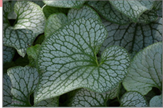
Sterling Silver Bugloss foliage

Sterling Silver Bugloss will grow to be about 12 inches tall at maturity, with a spread of 24 inches. When grown in masses or used as a bedding plant, individual plants should be spaced approximately 20 inches apart. It grows at a medium rate, and under ideal conditions can be expected to live for approximately 10 years. As an herbaceous perennial, this plant will usually die back to the crown each winter, and will regrow from the base each spring. Be careful not to disturb the crown in late winter when it may not be readily seen!