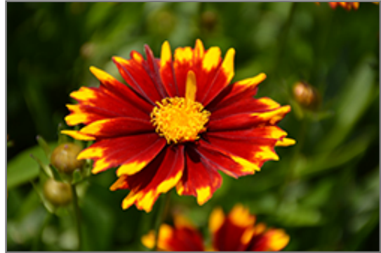
UpTick Red Tickseed flowers

UpTick Red Tickseed will grow to be about 12 inches tall at maturity, with a spread of 14 inches. Its foliage tends to remain dense right to the ground, not requiring facer plants in front. It grows at a medium rate, and under ideal conditions can be expected to live for approximately 10 years. As an herbaceous perennial, this plant will usually die back to the crown each winter, and will regrow from the base each spring. Be careful not to disturb the crown in late winter when it may not be readily seen!