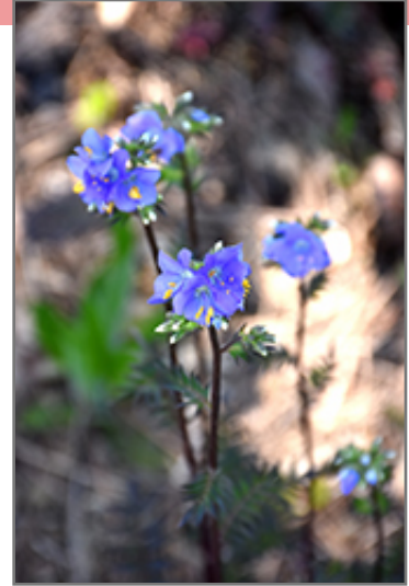
Purple Rain Jacob's Ladder flowers

Purple Rain Jacob's Ladder is recommended for the following landscape applications;