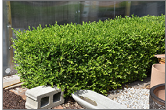
NewGen Independence Boxwood

NewGen Independence Boxwood is recommended for the following landscape applications;