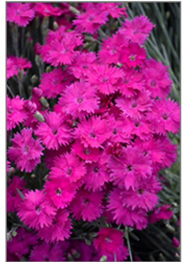
Neon Star Pinks flowers

Neon Star Pinks is an herbaceous evergreen perennial with a mounded form. It brings an extremely fine and delicate texture to the garden composition and should be used to full effect.