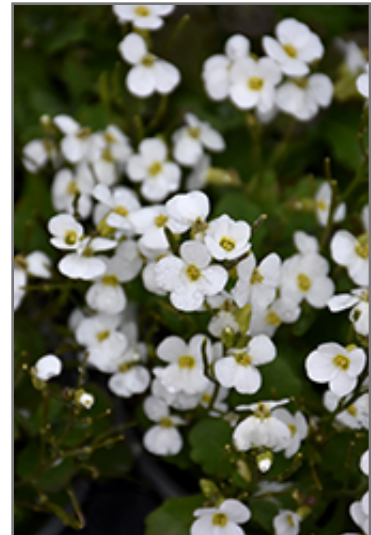
Catwalk White Wall Cress flowers

Catwalk White Wall Cress is recommended for the following landscape applications;