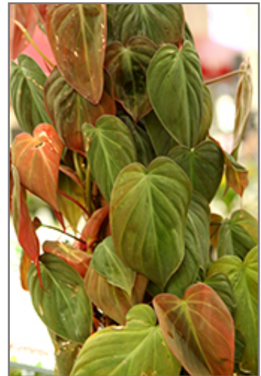
Velvet Leaf Philodendron foliage