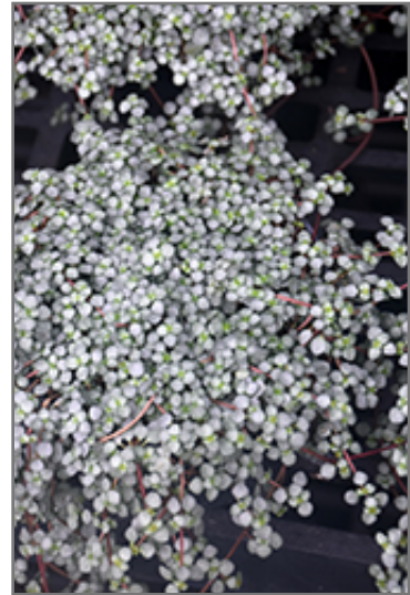
Aquamarine Pilea foliage