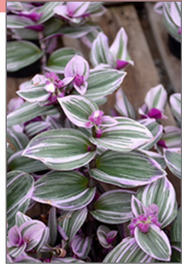
Nanouk Tradescantia foliage

This is an herbaceous evergreen houseplant with a spreading, ground-hugging habit of growth. Its relatively fine texture sets it apart from other indoor plants with less refined foliage. This plant may benefit from an occasional pruning to look its best.