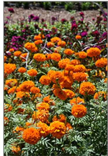
Xochi Orange Marigold flowers