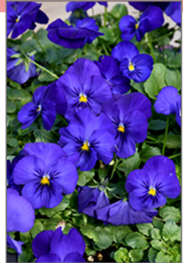
Cool Wave Blue Pansy flowers

Cool Wave Blue Pansy is recommended for the following landscape applications;