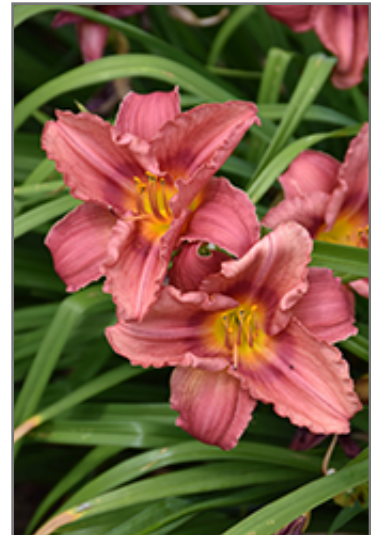
Happy Ever Appster Rosy Returns Daylily flowers

Happy Ever Appster Rosy Returns Daylily is an herbaceous perennial with a shapely form and gracefully arching foliage. It brings an extremely fine and delicate texture to the garden composition and should be used to full effect.