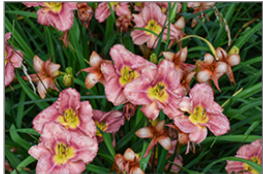
Happy Ever Appster Rosy Returns Daylily flowers