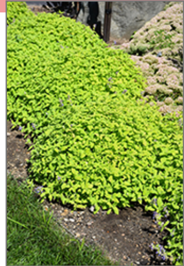
Chartreuse On The Loose Catmint