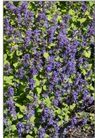
Chartreuse On The Loose Catmint flowers