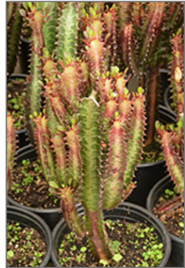
Rubra African Milk Tree in full