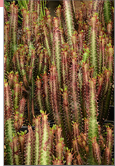
Rubra African Milk Tree stems

When grown indoors, Rubra African Milk Tree can be expected to grow to be about 9 feet tall at maturity, with a spread of 4 feet. It grows at a medium rate, and under ideal conditions can be expected to live for approximately 60 years. This houseplant will do well in a location that gets either direct or indirect sunlight, although it will usually require a more brightly-lit environment than what artificial indoor lighting alone can provide. It does best in average soil that is neither too wet nor too dry, and may die if left in standing water for any length of time. This plant should be watered when the surface of the soil gets dry, and will need watering approximately once each week. Be aware that your particular watering schedule may vary depending on its location in the room, the pot size, plant size and other conditions; if in doubt, ask one of our experts in the store for advice. Like most succulents and cacti, it prefers to grow in poor soils and should therefore never be fertilized. It is not particular as to soil pH, but grows best in sandy soil. Contact the store for specific recommendations on pre-mixed potting soil for this plant. Be warned that parts of this plant are known to be toxic to humans and animals, so special care should be exercised if growing it around children and pets.