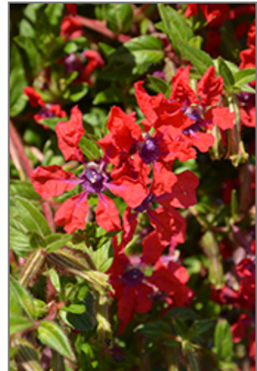
Sweet Talk Red Cuphea flowers

Sweet Talk Red Cuphea is recommended for the following landscape applications;