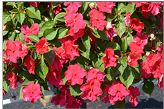
Beacon Lipstick Impatiens flowers