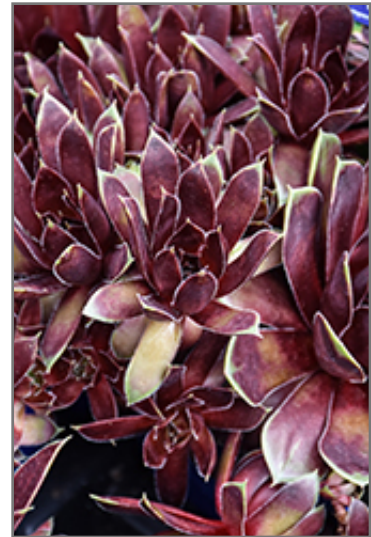
Colorockz Coconut Crystal Hens And Chicks