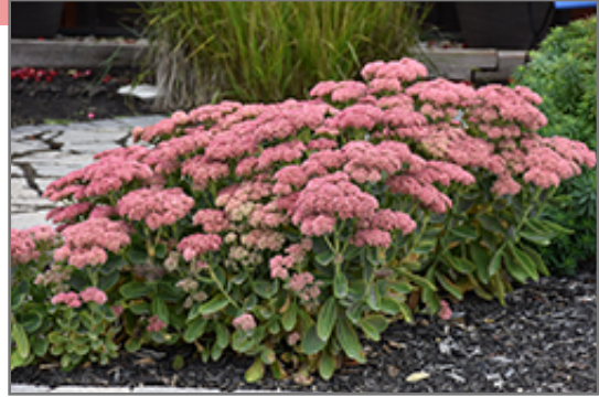
Autumn Fire Stonecrop in bloom

Autumn Fire Stonecrop is recommended for the following landscape applications;