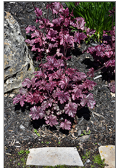
Midnight Rose Coral Bells