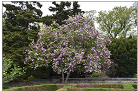
Jane Magnolia in bloom