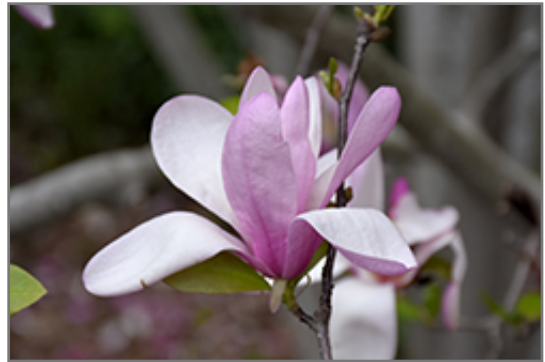
Jane Magnolia flowers

This shrub does best in full sun to partial shade. It requires an evenly moist well-drained soil for optimal growth, but will die in standing water. It is not particular as to soil type, but has a definite preference for acidic soils. It is quite intolerant of urban pollution, therefore inner city or urban streetside plantings are best avoided. Consider applying a thick mulch around the root zone in winter to protect it in exposed locations or colder microclimates. This particular variety is an interspecific hybrid.