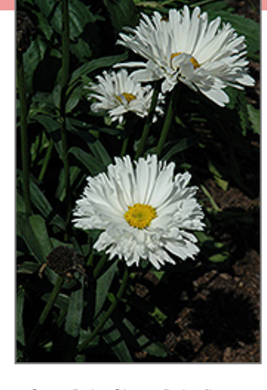
Crazy Daisy Shasta Daisy flowers