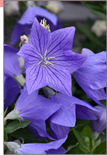
Sentimental Blue Balloon Flower flowers

Sentimental Blue Balloon Flower is recommended for the following landscape applications;