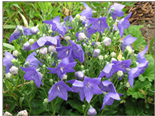
Sentimental Blue Balloon Flower in bloom