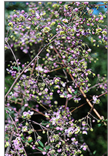
Rochebrun Meadow Rue flowers