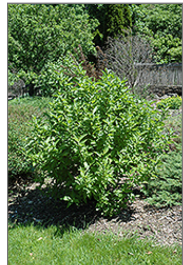
Arctic Fire Red Twig Dogwood