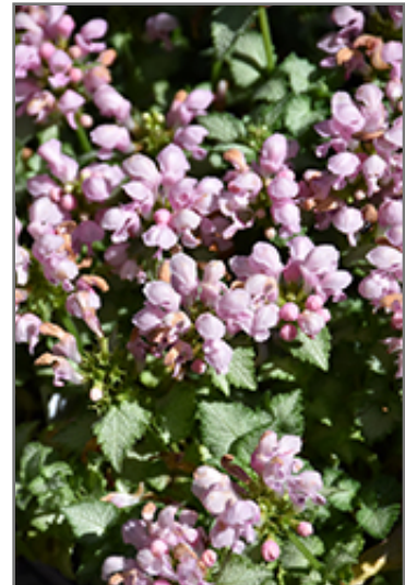
Pink Pewter Spotted Dead Nettle flowers

Pink Pewter Spotted Dead Nettle is recommended for the following landscape applications;