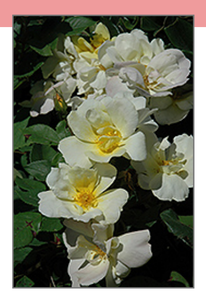
Sunny Knock Out Rose flowers