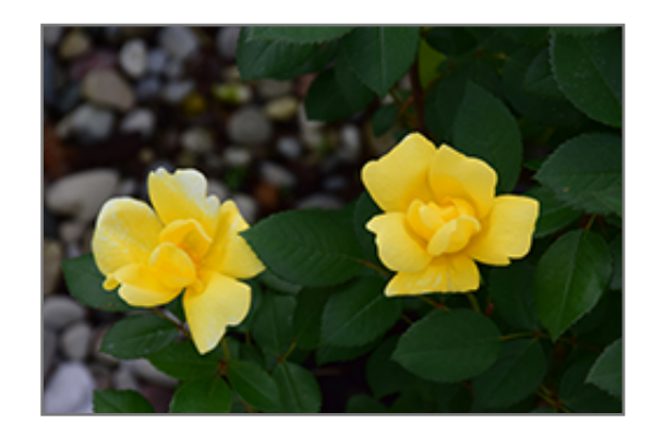
Sunny Knock Out Rose flowers