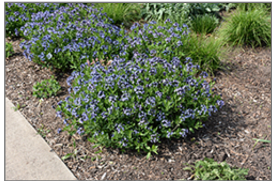
Blue Ice Star Flower in bloom