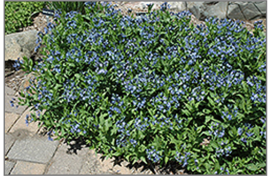
Blue Ice Star Flower in bloom

This plant does best in full sun to partial shade. It prefers to grow in average to moist conditions, and shouldn't be allowed to dry out. It is not particular as to soil type or pH. It is quite intolerant of urban pollution, therefore inner city or urban streetside plantings are best avoided. This is a selection of a native North American species. It can be propagated by cuttings; however, as a cultivated variety, be aware that it may be subject to certain restrictions or prohibitions on propagation.