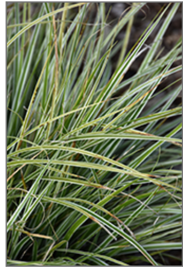
EverColor Everest Japanese Sedge foliage