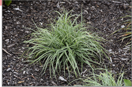
EverColor Everest Japanese Sedge

EverColor Everest Japanese Sedge is recommended for the following landscape applications;