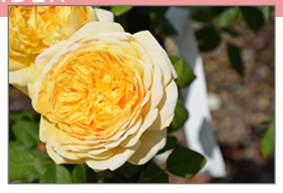
Charles Darwin Rose flowers