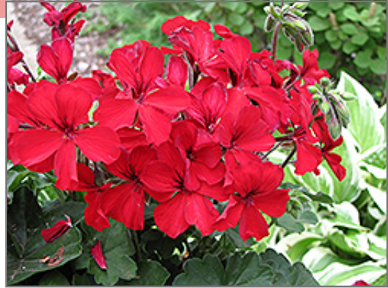
Caliente Fire Geranium flowers