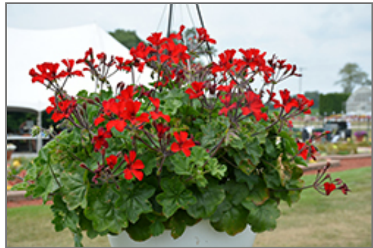
Caliente Fire Geranium in bloom