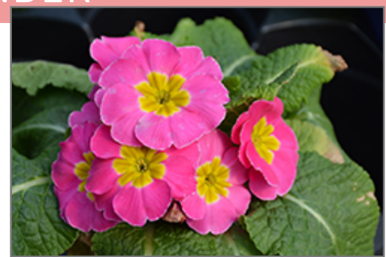
Supernova Pink Primrose flowers