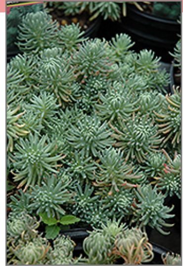
Oracle Stonecrop

An outstanding groundcover sedum, this one is covered in golden flowers in late spring; tough and easy to grow, it thrives in just about any sunny location; forms a lustrous gray-green groundcover that is occasionally infused with red tones