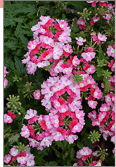
Lanai Twister Red Verbena flowers

Lanai Twister Red Verbena is recommended for the following landscape applications;