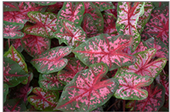
Carolyn Whorton Caladium foliage