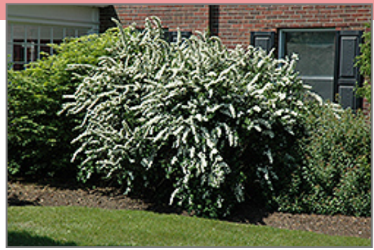
Renaissance Spirea in bloom