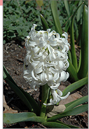
White Pearl Hyacinth flowers