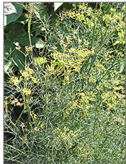
Bronze Fennel in bloom