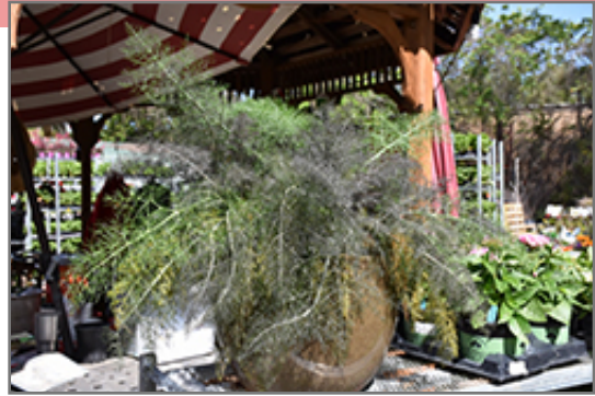
Bronze Fennel

Bronze Fennel has masses of beautiful yellow flat-top flowers held atop the stems in mid summer, which are most effective when planted in groupings. The flowers are excellent for cutting. Its attractive fragrant ferny leaves emerge burgundy in spring, turning bluish-green in color with showy coppery-bronze variegation and tinges of purple throughout the season.