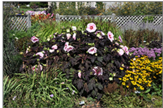
Starry Starry Night Hibiscus in bloom