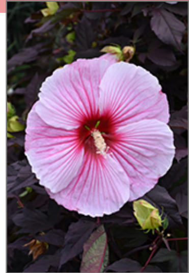
Starry Starry Night Hibiscus flowers

This plant will require occasional maintenance and upkeep, and should be cut back in late fall in preparation for winter. It is a good choice for attracting butterflies and hummingbirds to your yard, but is not particularly attractive to deer who tend to leave it alone in favor of tastier treats. Gardeners should be aware of the following characteristic(s) that may warrant special consideration;