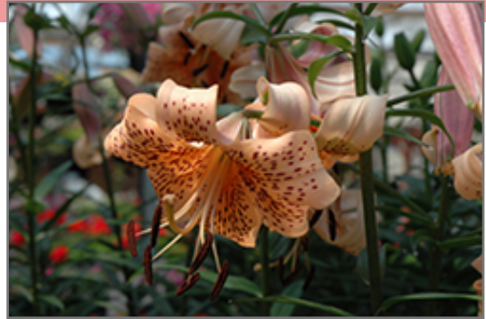
Splendens Tiger Lily flowers