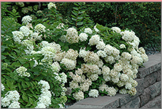
Pee Gee Hydrangea in bloom