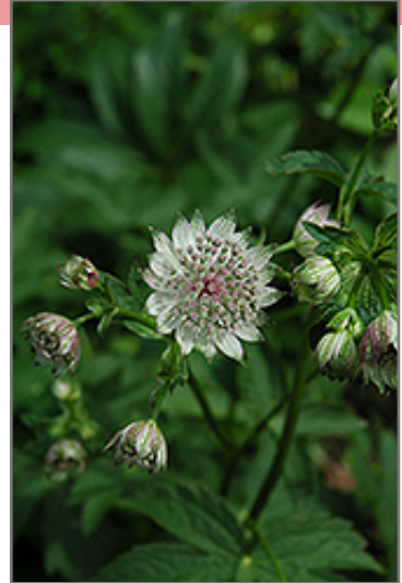
Great Masterwort flowers